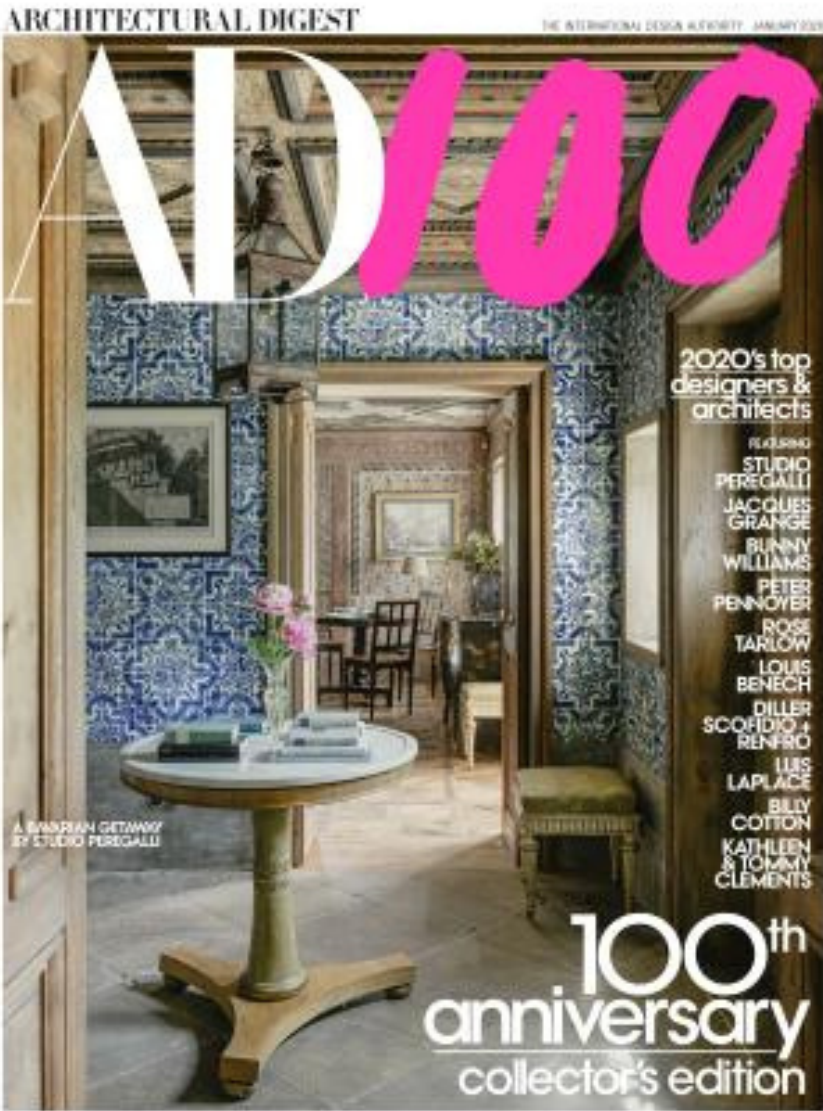
MEDIA PARTNERS: TRADITIONAL HOME, BUSINESS OF HOME, AD PRO AND MORE